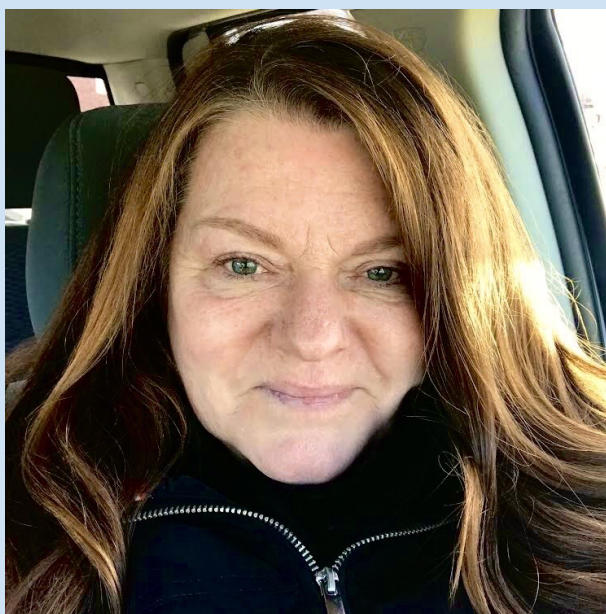
Teacher, French & Dean of Students